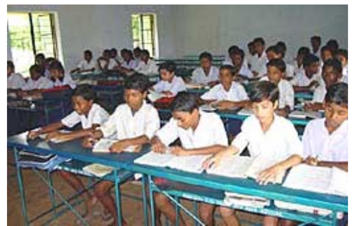
Working from textbooks or worksheets