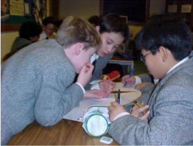
Discussing in groups