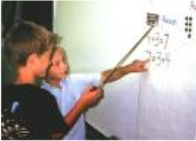
Sharing at the board