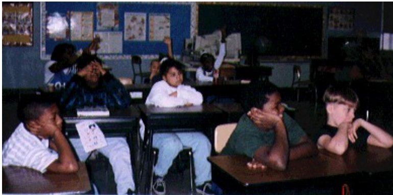
Listening to the teacher